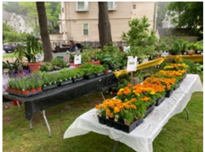
Arlington Garden Club's plant sale