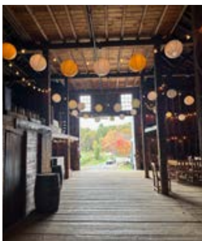
WLF's 1827 barn