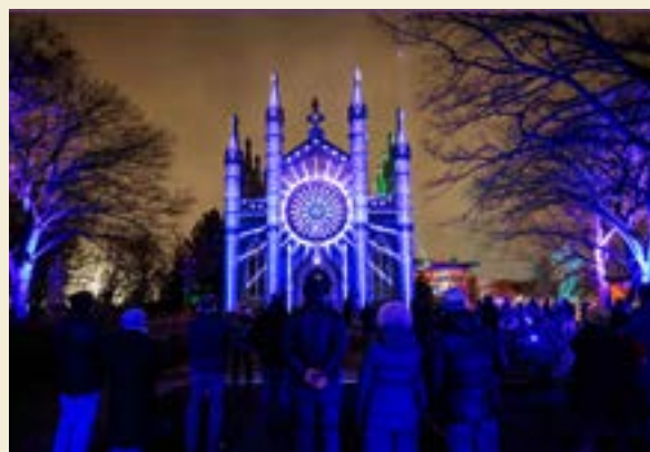
A scene from Mount Auburn Cemetery's SOLSTICE celebration

Thinking ahead to the holiday season, you can choose between two beloved outdoor extravaganzas. Mount Auburn Cemetery offers a SOLSTICE celebration (Dec 5 to 21), with light and sound artworks and more. Buy timed tickets here And Mass Hort, at Elm Bank, Wellesley, offers its annual Festival of Trees (Nov 28 to Dec 28), with a wonderland of beautifully decorated trees, plus model trains and more. Buy timed tickets here