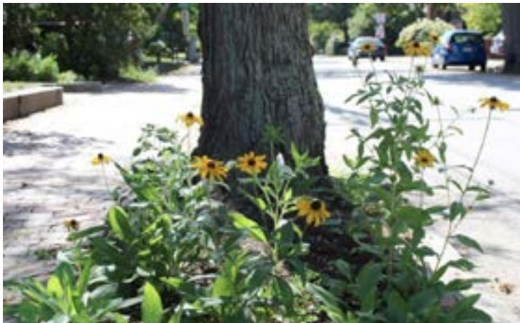
Black-eyed coneflower are a cheerful addition to a hellstrip.

Jennifer Fraulo Strassfeld, who spoke last month about how to supercharge landscapes for watershed health, has kindly provided this helpful document about planting “hell” strips in our yards.