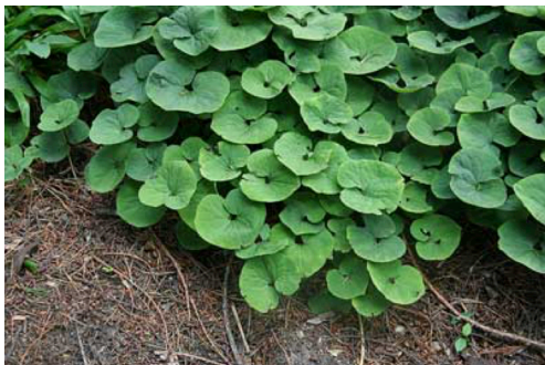
Canadian Ginger Asarum canadense