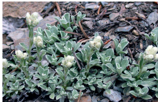
Woman's Tobacco Antennaria plantaginifolia