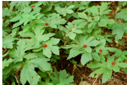
Goldenseal Hydrastis canadensis