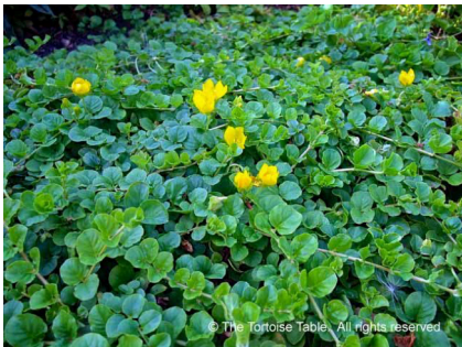
Creeping Jenny Lysimachia nummularia L.

If you want to get rid of it, pulling by hand is best. Just be sure to get all the roots. Some native replacements are: Canadian ginger ( Asarum canadense ); Goldenseal ( Hydrastis canadense ); Woman's tobacco ( Antennaria plantaginifolia )